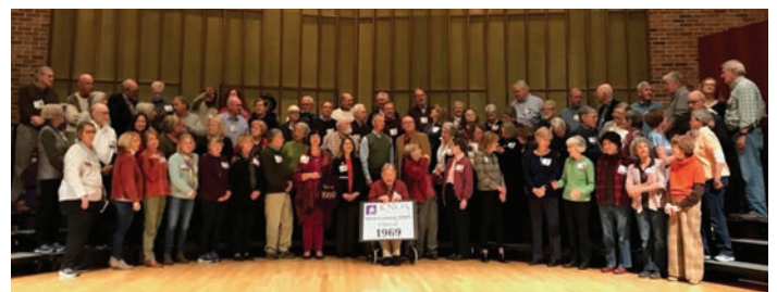
The Class of '69 is gearing up for their 55th Reunion.