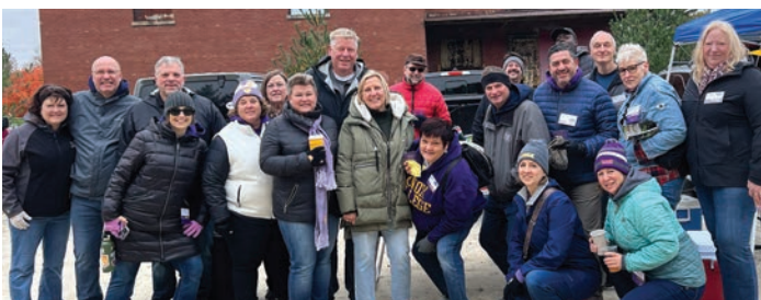
Members of the Class of '92 at Homecoming 2023.